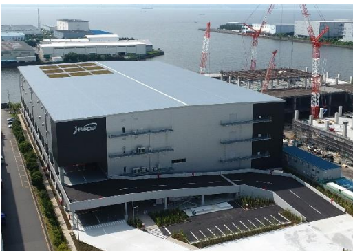
【Exterior view of the facility】