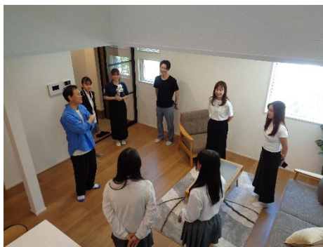
[Scene from the Video Shooting Method Training]