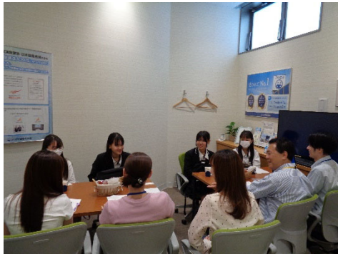
[Scene from the Preliminary Meeting]