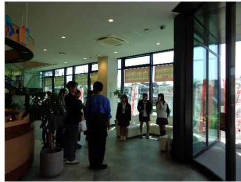
[Scene from the Morning Assembly]