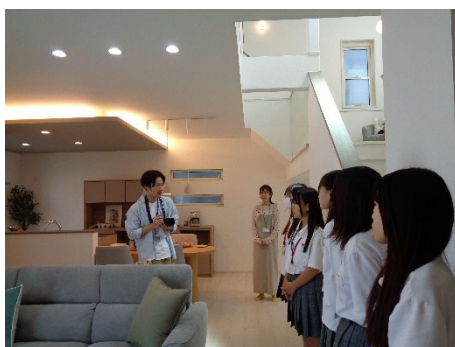
[Scene from the Camera Operation Training]