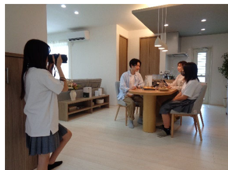
[Scene from the Camera Shooting Experience]