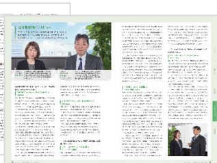
Interviews with Outside Directors