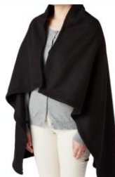
Large size: Can be wrapped around the shoulders