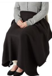
Protection from cold in autumn/winter