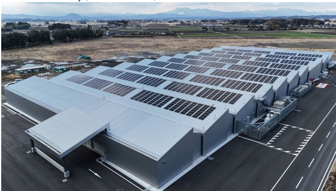
The Hanaoka Factory (as of March 2025)