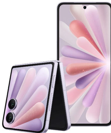
HONOR "Magic V Flip2" (Dinorex UTG™ is used in the inner main display)