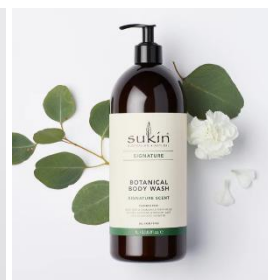
Botanical Body Wash