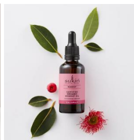
Organic Rosehip Oil