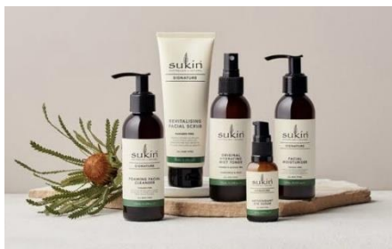
Sukin signature series (From left to right: Foamed facial cleanser, Facial scrub, Mist toner, Eye serum, Facial moisturizer)